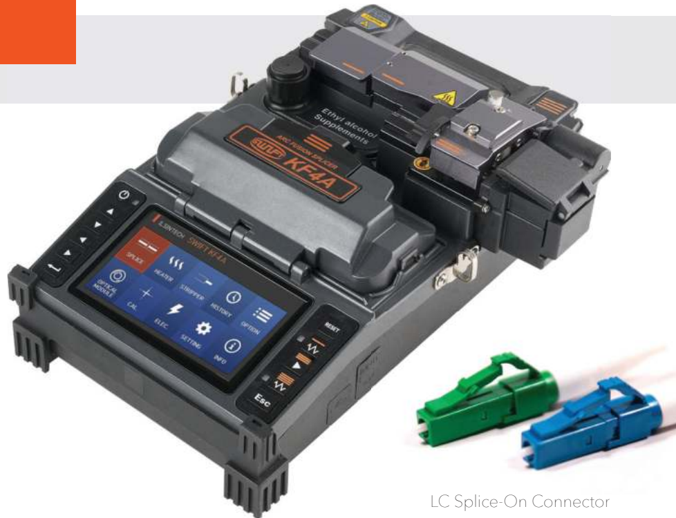
LC Splice-On Connector

The Swift KF4A is a highly advanced and accurate active cladding alignment fusion splicer. It has been designed to perform the major 5 multifunctional features systematically: stripping, cleaning, cleaving, splicing and sleeving (All-In-One). The Swift KF4A is the best fit for fusion splicing and fusion splice-on connectors (SOC) of FTTx network applications. The KF4A eliminates fatal issues common with conventional mechanical connectors including low quality, weak durability and high maintenance costs. The Swift KF4A fusion splicer coupled with our fusion splice-on connectors provides customers the best ROI.